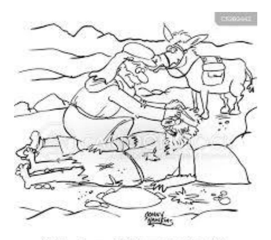
"Thank you. My insurance doesn't include roadside service."