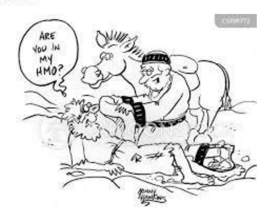
"I'm part of God's TLC plan."