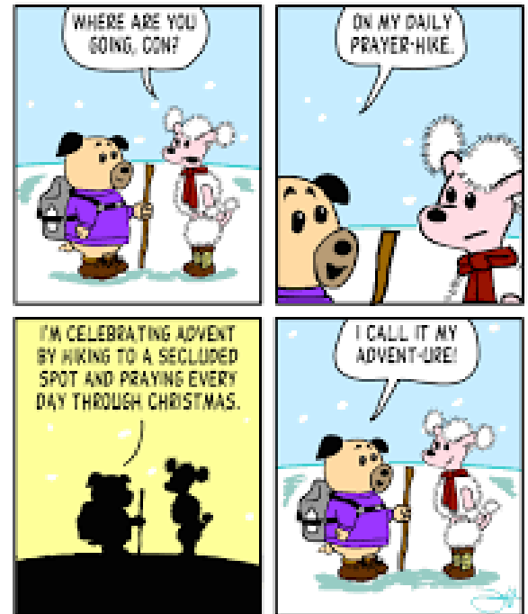
ADVENT IS A TIME OF ANTICIPATION, HOPE AND NEW BEGINNINGS.

What happens when the Christmas Pageant gets scheduled in mid-December.