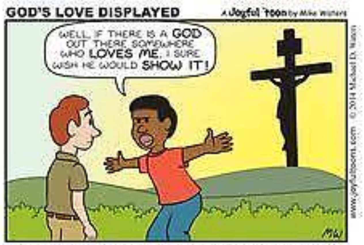
But God demonstrates his own love for us in this: While we were still sinners, Christ died for us: - Rowes 5:8 wy